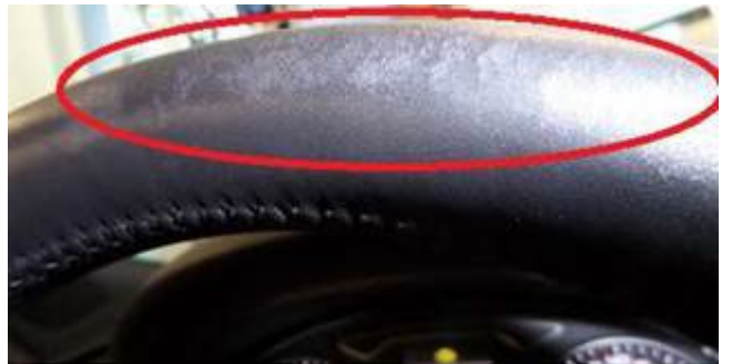
Figure 3. Example of damage from external impact.