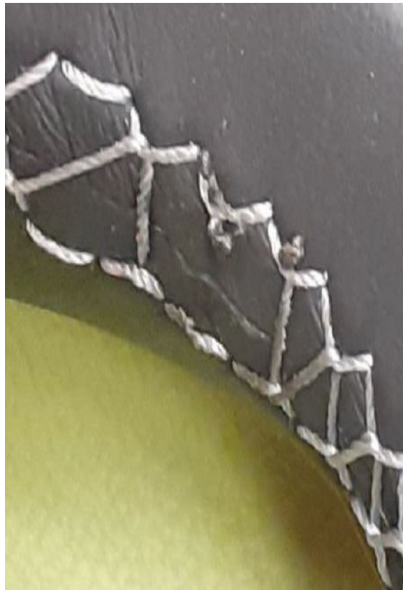
Figure 5. Example of damage from external influences.