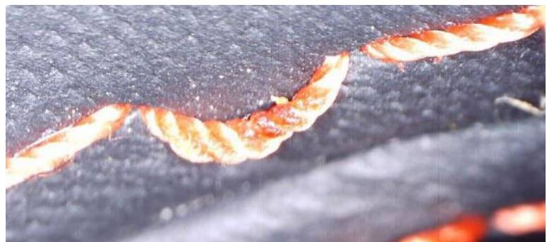
Figure 6. Example of damage from external influences.