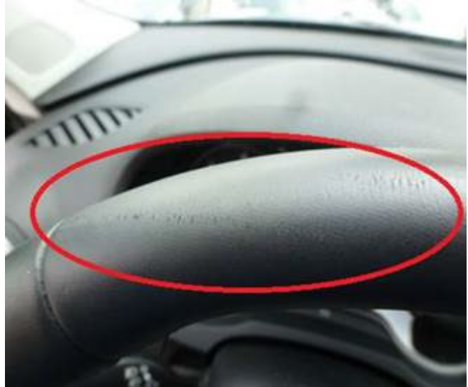
Figure 2. Example of damage from external impact.