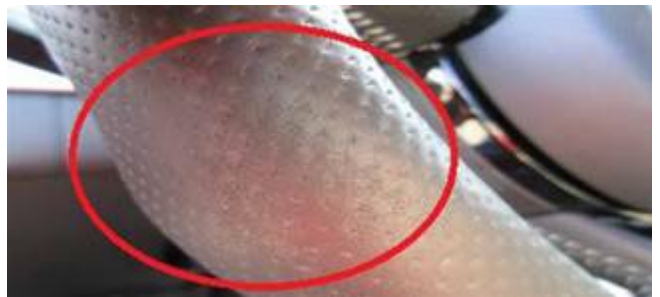
Figure 4. Example of damage from external impact.