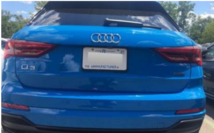
Figure 2. The rear license plate successfully installed on the new Q3.