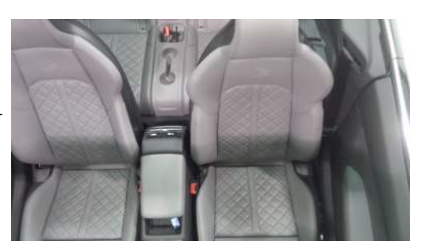
Page 1 of 4

Only vehicles with S Sport Seats (PR Code Q4Q) are affected. The seatbelts