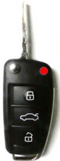
Figure 2. Red LED flashes twice, signaling that the “key inside vehicle” recognition is active.

Pressing button (1) or (2) repeatedly while the “key inside vehicle” recognition is active, increases the length of this reset period.