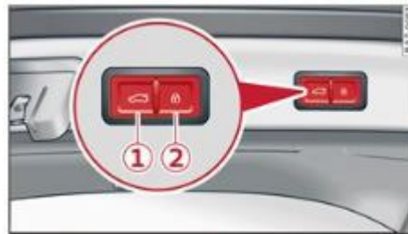
Figure 1. Luggage compartment lid: (1) closing button (2) lock button (vehicles with convenience key).