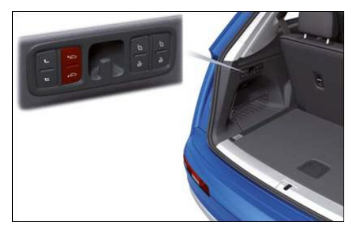
Figure 1. Location of the controls for lowering the rear suspension.

If the button for the rear suspension lowering is unintentionally operated when driving (for example by objects moving in the trunk area), the rear suspension lowering is sporadically not available (Figure 1).