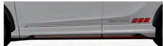
Body side decal

The body side decal is light reflective and the Eclipse Cross logo is also available.