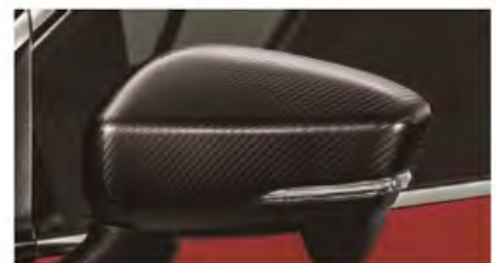
Door mirror cover

Black carbon-look and chrome covers are available to easily differentiate from standard styling.