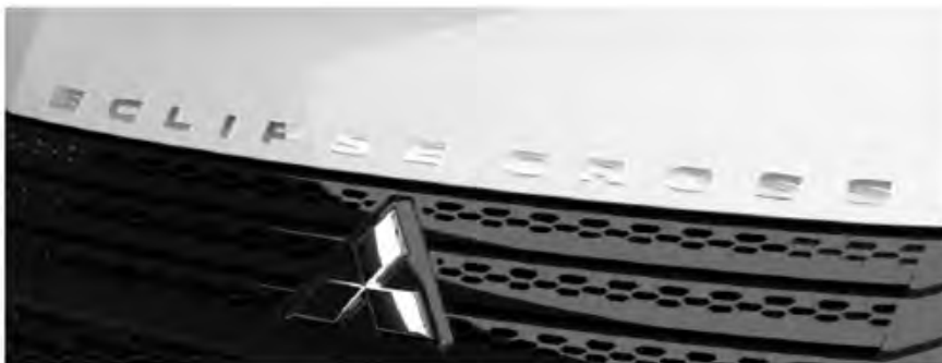
Engine hood emblem

The engine hood emblem is available in two color options (silver and black).