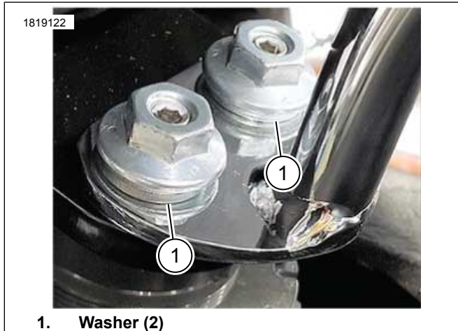
Figure 2. Incorrect-Extra Washer

Torque: 5–7 ft-lbs (6.8–9.5 N·m) Flange Nut