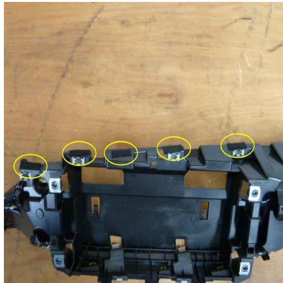
Figure 3. Apply felt strips to the circled areas.