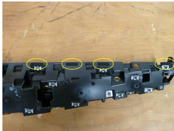
Figure 4. Apply felt strips to the circled areas.