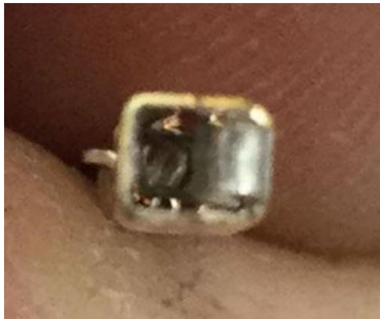
Figure 2: Damaged pin.

Repair the wires as needed using VAS 1978 B