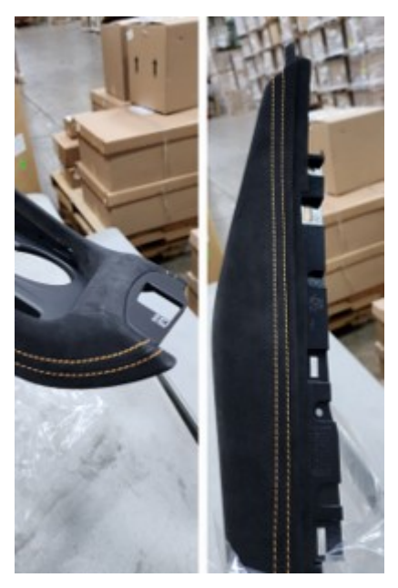
Fig. 1 Correct Color Stitching (ORANGE)

1. Does the vehicle have orange color stitching on the console? (Fig. 1), (Fig. 2)?