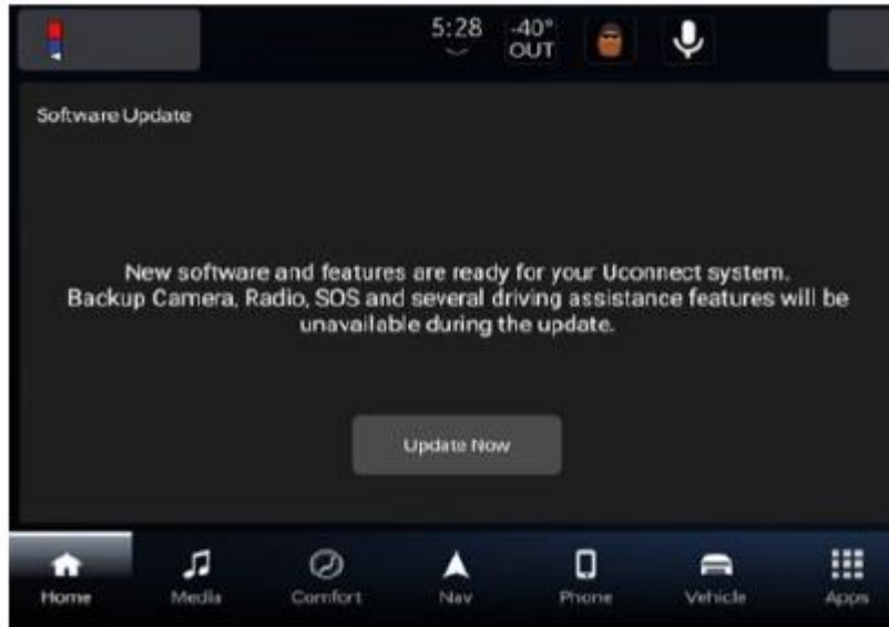
Fig. 1 Software Acceptance Screen

NOTE: This is an Information Only Technical Service Bulletin to inform the dealer how the FOTA update is performed. This document does not contain a LOP for reimbursement.