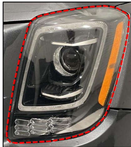
Halogen Headlamp Assembly

This bulletin provides information associated with the 'Halogen Headlamp High Beam Warranty Extension Program' (WTY030) to replace the affected (left and/or right side) headlamp assembly on certain 2020MY Telluride (ON) LX/S/EX vehicles, produced at Kia Georgia from January 09, 2019 through November 18, 2019, which may exhibit a loss of high-beam functionality. Due to an internal failure in the headlamp, the high-beam lights may not illuminate when turning the light switch from the low to high beams. The low-beam function is not affected. The vehicle's warranty for this issue will be extended from 5 years/60,000 miles to 15 years/150,000 miles, whichever comes first, starting from the date the vehicle was first put into service. Follow the procedure outlined in this publication to replace the (left and/or right side) halogen headlamp assembly with a new part.