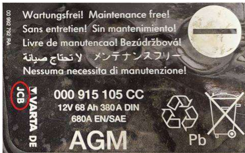
Figure 2: Example of the manufacturer/vendor code on the battery label.