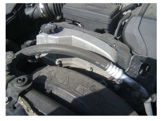
Under hood components