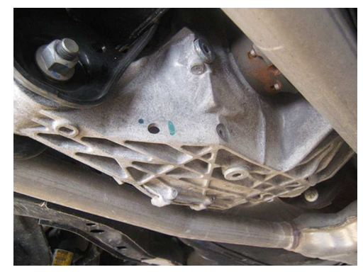
Rear differential housing