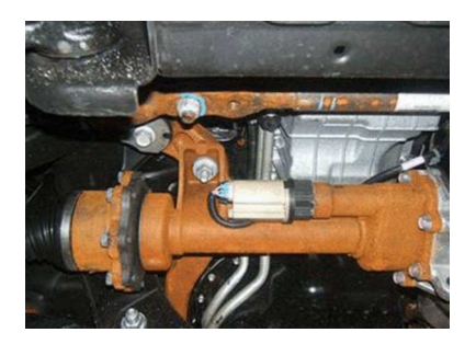
Front axle housing