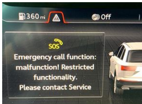
Figure 1: SOS Malfunction A4/A5/Q5

Emergency call function: malfunction! Restricted functionality. Please contact service.