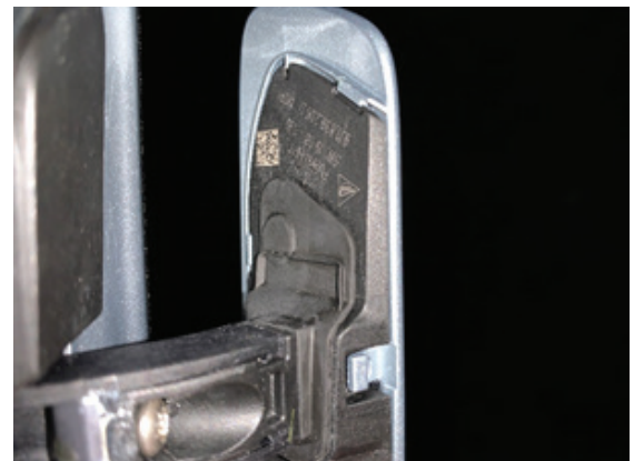
Figure 3: Manufacturing Stamp on Door Handle