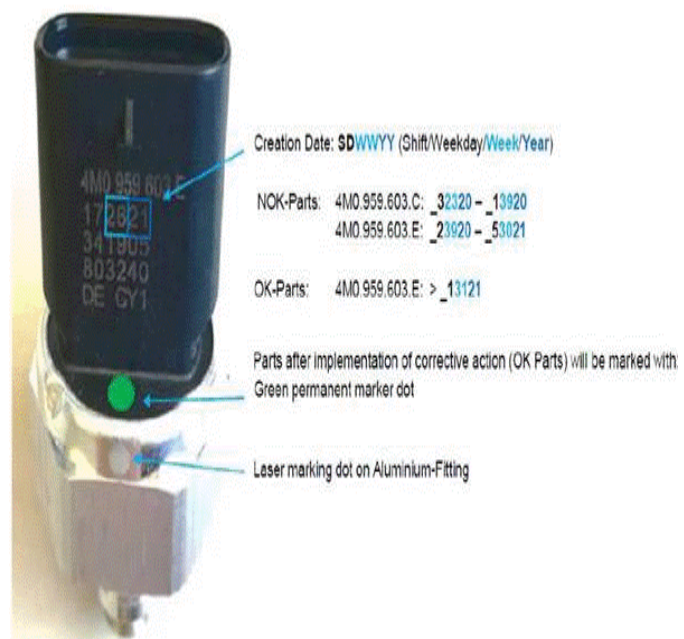
Figure 1. Pressure and temperature sensor markings and build date.