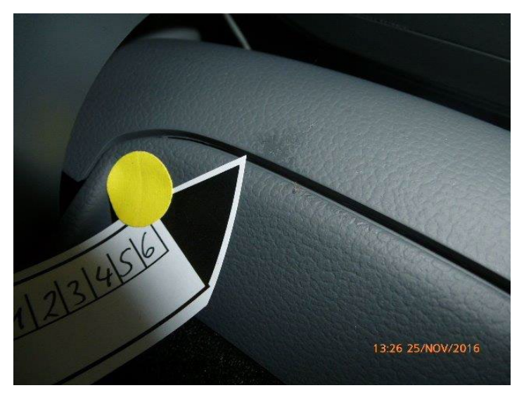
Figure 2. The second photo should show an up-close look at the optical defect.

3. Log into Audi Warranty Online and submit the photographs to Doc-IT with the RO number and VIN.