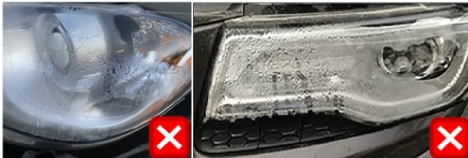
Fig. 3 Condensation/Fogging Not Begun To Clear

If the condensation/fogging has not begun to clear after 20 minutes with the lamps operating, or the lamp has large amounts of water droplets visible on most internal surfaces, this indicates a problem with the lamp sealing that has allowed water to enter the lamp. In this instance, the customer is also likely to report that moisture in the lamp is always present and never disappears (Fig. 3) . A lamp that exhibits internal moisture permanently should be replaced.