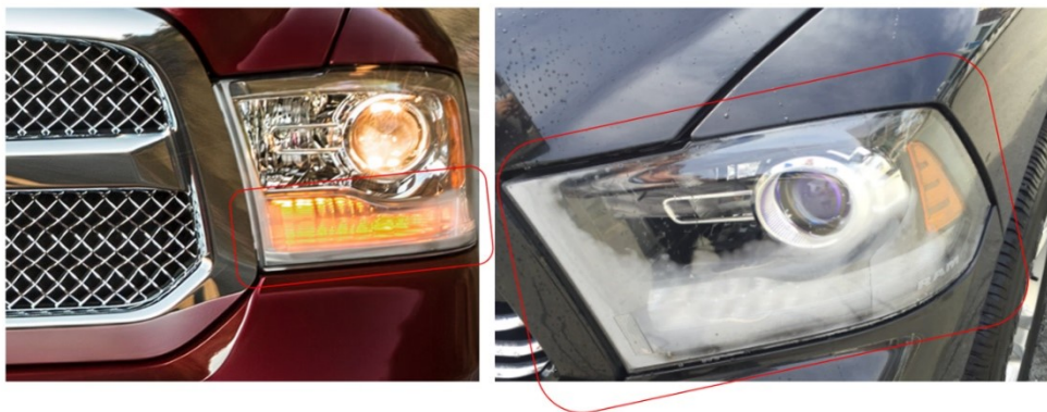
Fig. 1 Fogged Head lamps

Some customers may report that on occasion, vehicle exterior headlamp assemblies are fogged with a light layer of condensation on the inside of the lenses (Fig. 1). This may be reported after the lamps have been turned on and brought up to operating temperature, turned off, and then rapidly cooled by cold water (such as rain, or the water from a vehicle wash). Lens fogging can also occur under certain atmospheric conditions after a vehicle has been parked outside overnight (i.e., a warm humid day followed by clear cool night). This will usually clear as atmospheric conditions change to allow the condensation to change back into a vapor. Turning the head lamp on will usually accelerate this process.