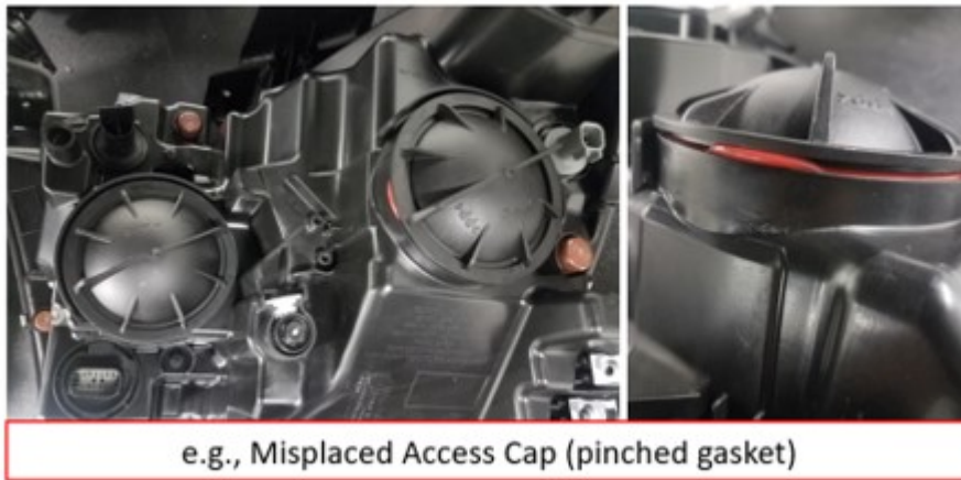
Fig. 6 Misplaced Sealing Components

If no obvious causes are observed, proceed using the failure code for leaks (65) and replace the head lamp. Refer to the detailed service procedures available in DealerCONNECT/Service Library under: Service Info>08 - Electrical / 8L - Lamps and Lighting / Lamps/Lighting - Exterior / Unit, Front Lamp / Removal and Installation.