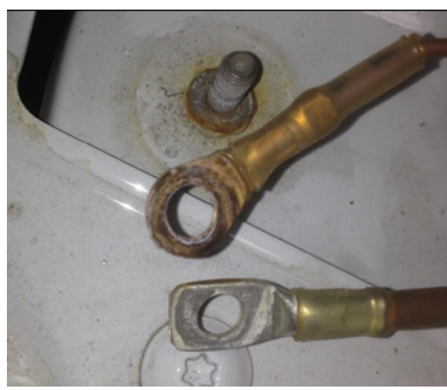
Figure 2 – Example of corrosion on ground point