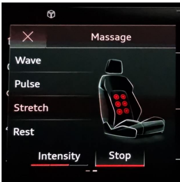
Figure 1: massage pop-up

The pop-up message for the seat massage function is no longer displayed on the MMI screen when the massage button is pressed (Figure 1).