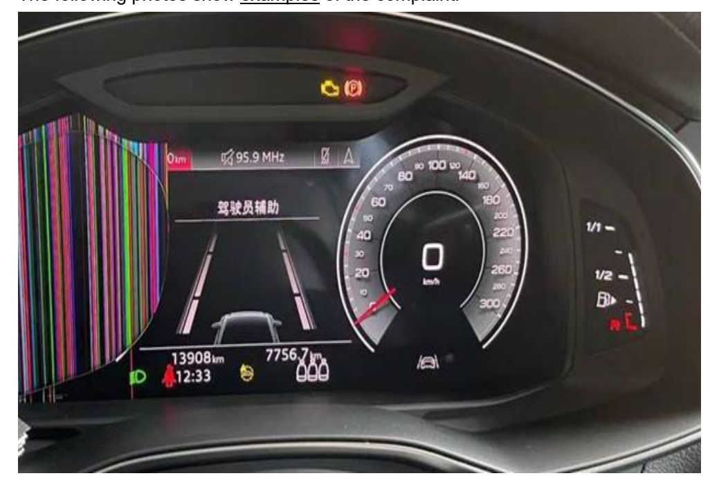
Page 1 of 6

The following photos show examples of the complaint: