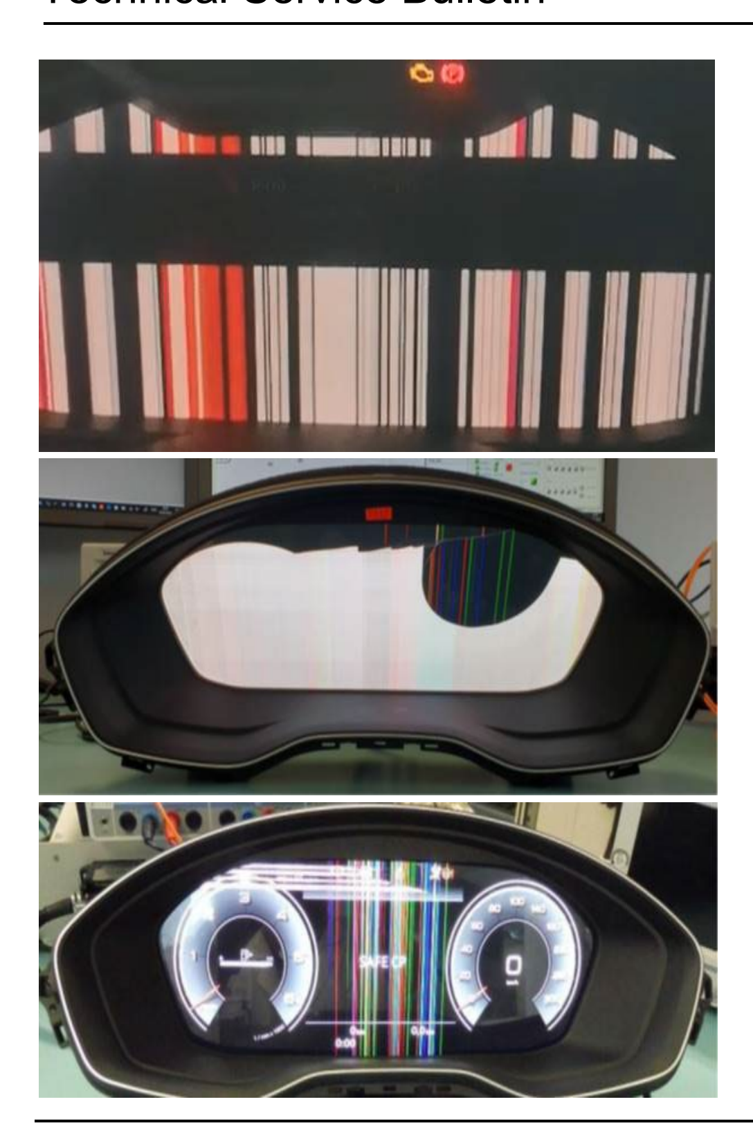
Page 3 of 6