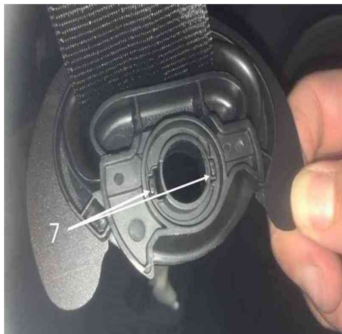
Figure 8. Seat belt deflector trim locking tabs properly secured to the seat belt guide.