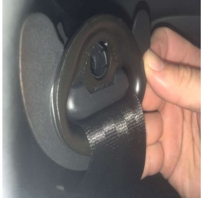
Figure 3. Removing old seat belt guide starting at the bolt hole.