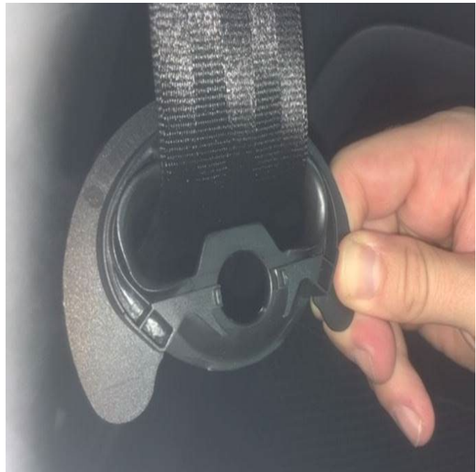
Figure 4. Old seat belt guide removed. The seat belt twist is corrected.