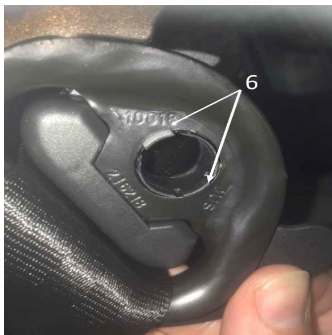
Figure 7. Belt guide locking tabs correctly secured at the bolt hole.