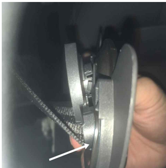
Figure 5. Installing modified seat belt guide starting with the metal tab on the bottom.