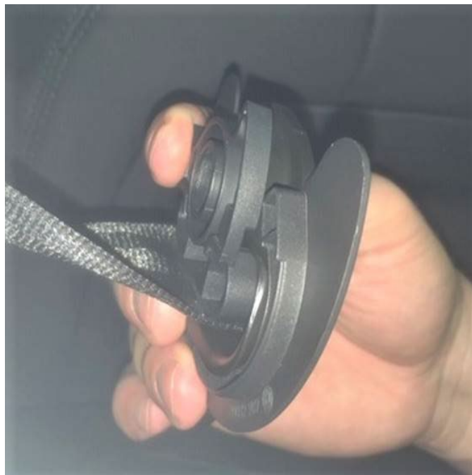
Figure 6. Seat belt deflector with the new guide installed.