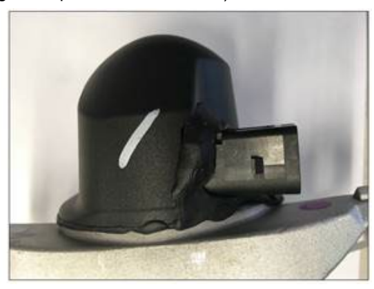
Figure 1. Example of Butyl sealing cord application and component location.