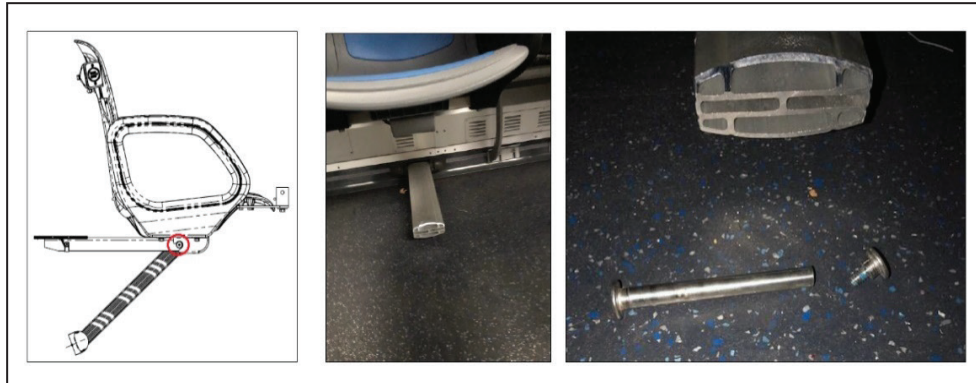
Figure 2 - Passenger Aisle Facing Seat