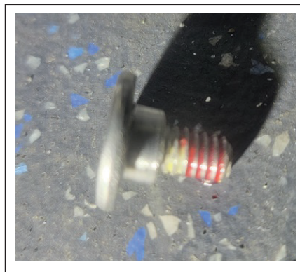
Figure 3 - Apply Loctite Thread Locker 262