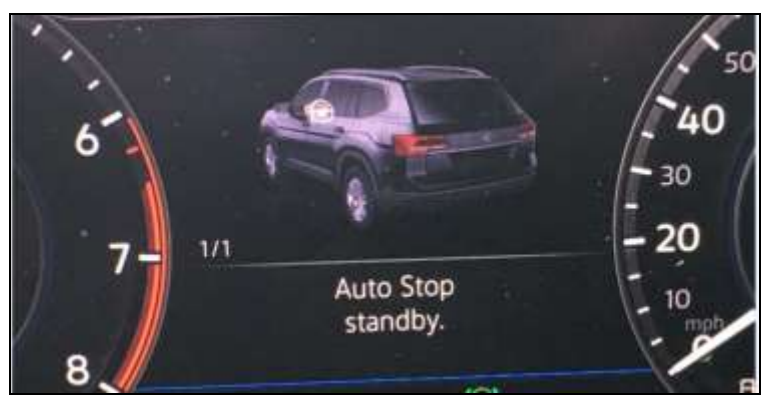
Figure 1: Message example