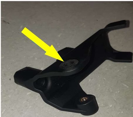
Fig 1. – Left handguard support