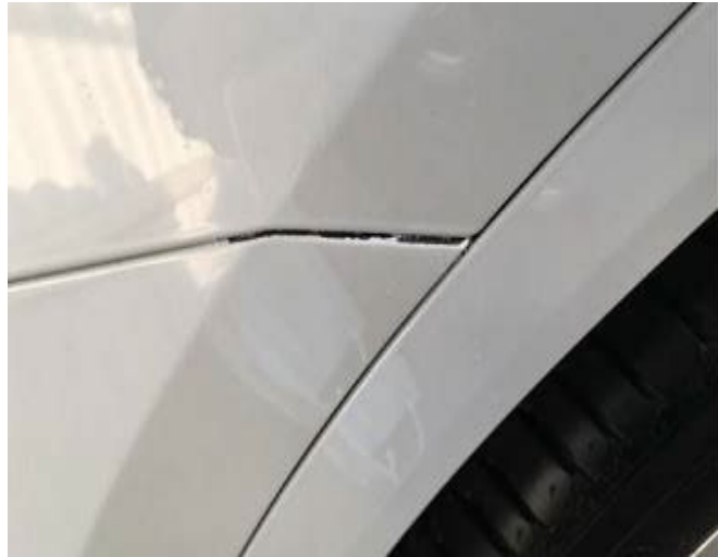
Figure 5. Advanced paint peel.