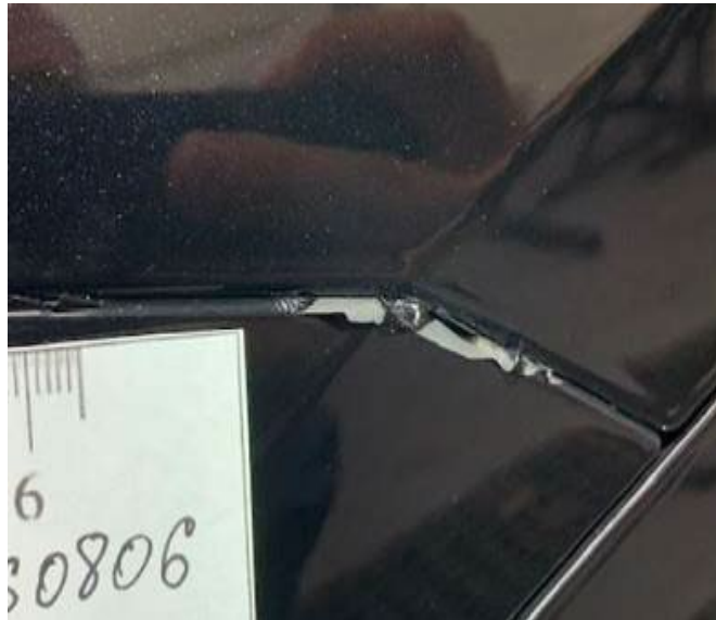
Figure 2. Paint peel on the bumper cover edge.