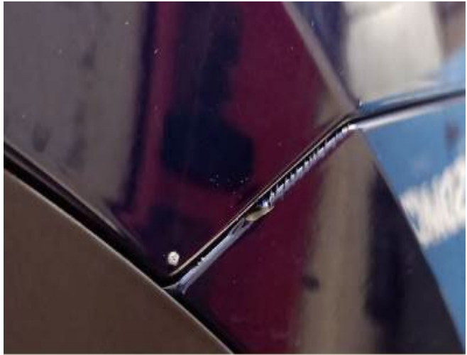
Figure 3. Early stages of the peel.