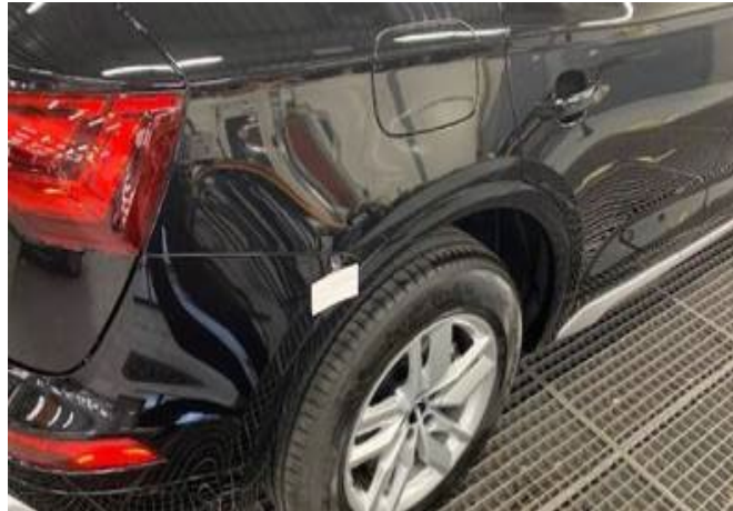
Figure 1. Bumper cover edge affected.