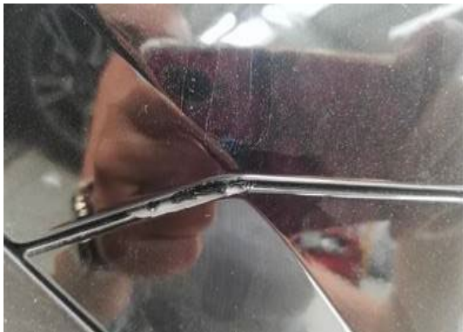
Figure 4. Moderate loss of adhesion.