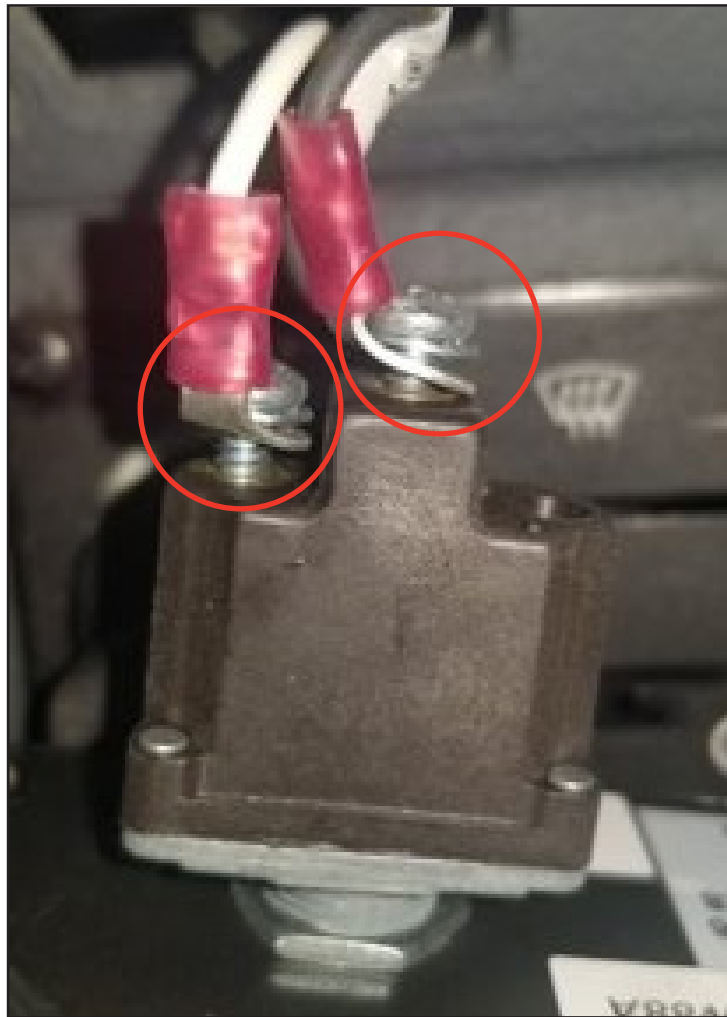
Figure 3 - Screws (2x) at back of the switch