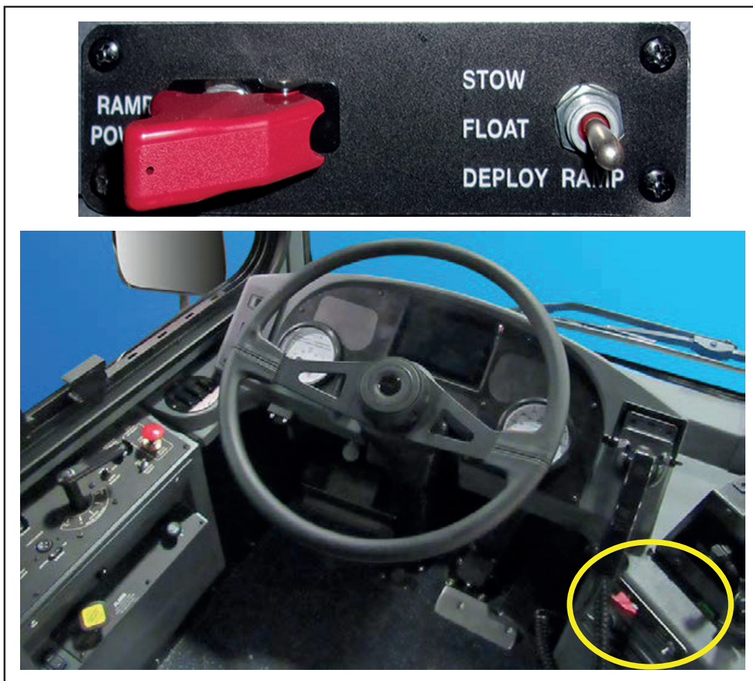
Figure 1 - Location of Wheelchair Ramp Switch