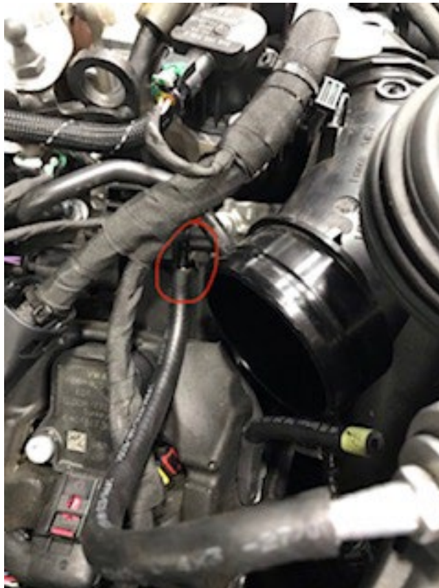
Figure 2. The output port of N649 (close-up picture).