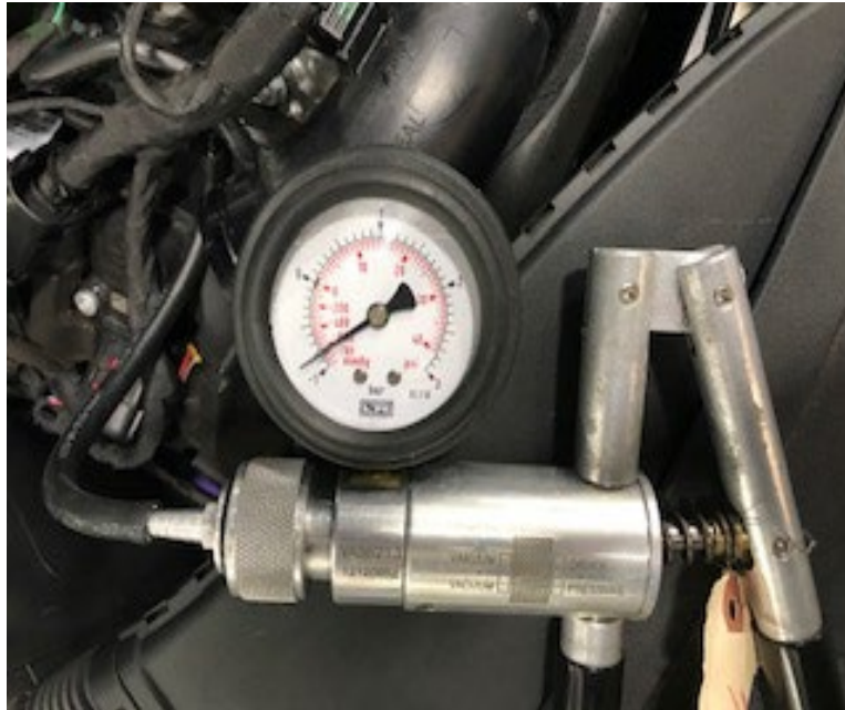
Figure 1. Checking the vacuum at the output port of N649.

b. If there is no vacuum measured at the output port of N649, the cause of the fault could be related to the solenoid valve N649 or the vacuum hoses (check for leaks). In this case, repair and check the operation of the vacuum system.