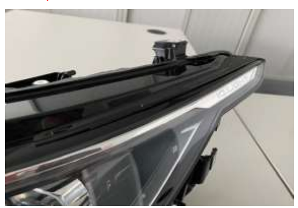
Figure 4. Figure 5.

• Re-install headlight assembly according to ⇒ Workshop Manual.