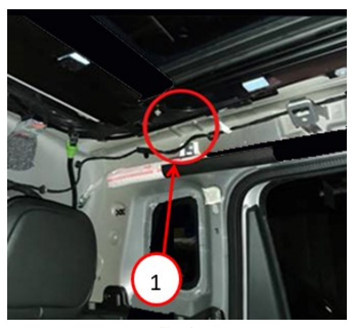
Fig. 1 Sealing Area