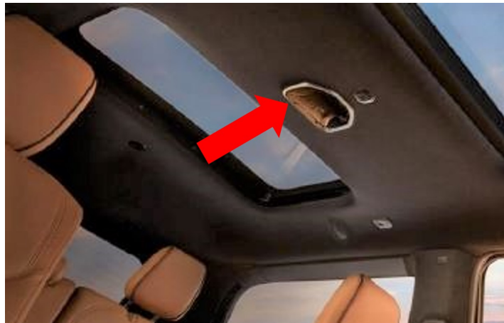
Fig. 1 Interior Rear Facing Camera Bezel

This Technical Service Bulletin (TSB) has also been released as a Rapid Service Update (RSU) 23-012, date of issue January 25, 2023. All applicable UnSold RSU VINs have been loaded. To verify this RSU service action is applicable to the vehicle, use VIP or perform a VIN search in DealerCONNECT/Service Library. All repairs are reimbursable within the provisions of warranty. This RSU will expire 18 months after the date of issue.