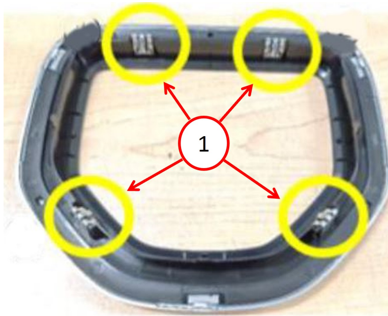
Fig. 2 Four Retention Clip Locations