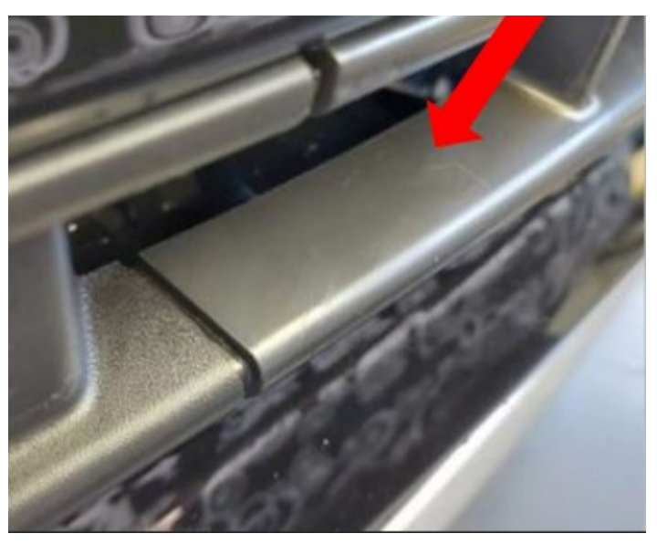
Fig. 3 Incorrect Center Grille With Smooth Surface

• If the center grille surface is smooth, vehicle has the incorrect center grille: (Fig. 3) .