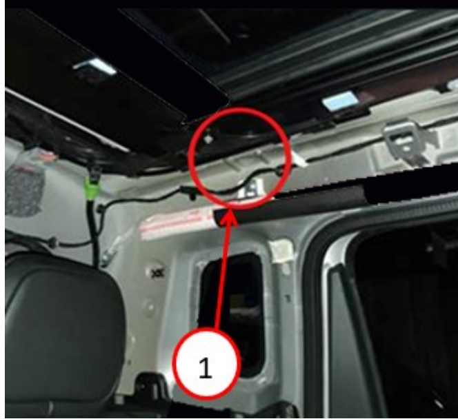
Fig. 1 Sealing Area