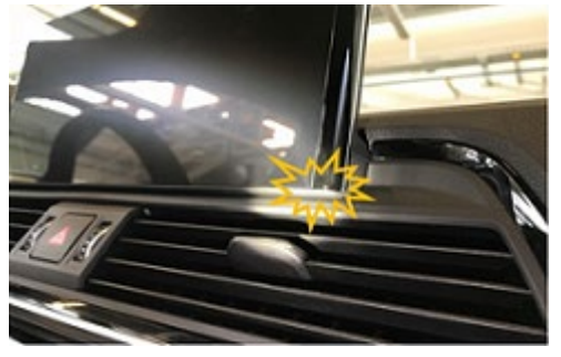
Figure 1. The gap between the MMI screen and the center vent should be 0.5 mm or greater.