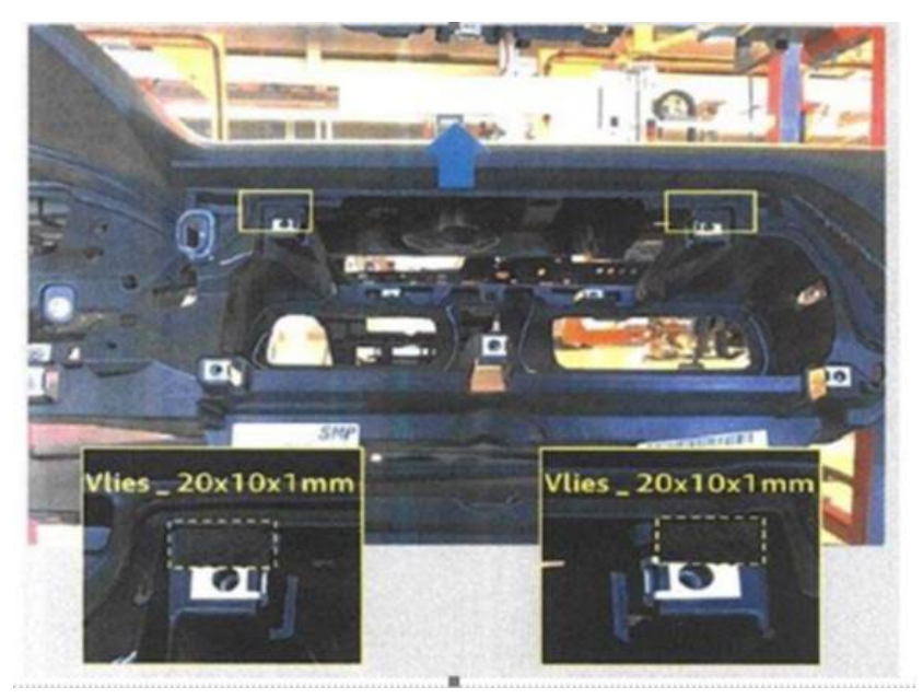
Figure 2. Apply two pieces of felt tape to the dash panel in the area shown.