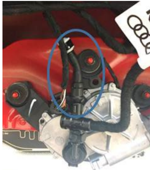
Figure 3. Check valve assembly installed on the e-tron model.