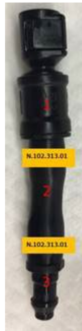
Figure 2. Check valve assembly.