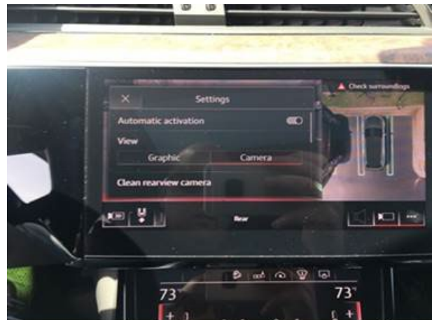
Figure 1. Clean rearview camera function being displayed.