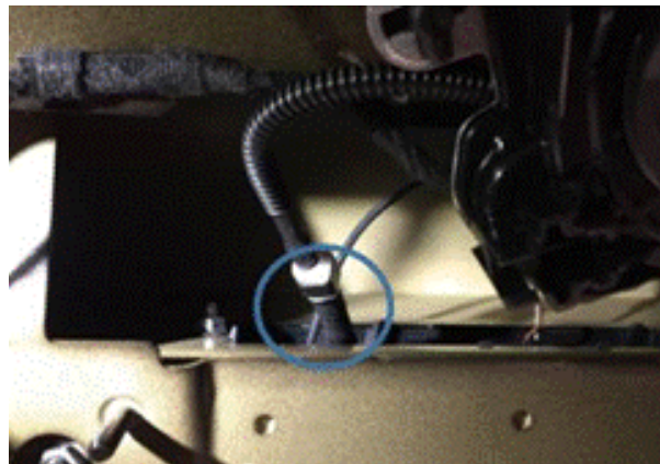
Figure 4. Check valve assembly installed on the e-tron Sportback model.