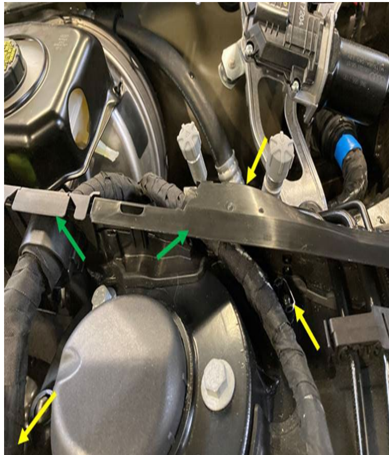
Figure 1: Plenum chamber covers (green arrows).

Using a seam ripper, expose the wiring harness as shown in Figure 2.