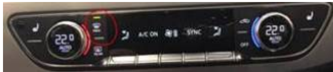
Figure 6. 72° f (22° c), Sync, max defrost.