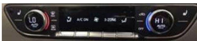
Figure 1. Starting HVAC control setting.