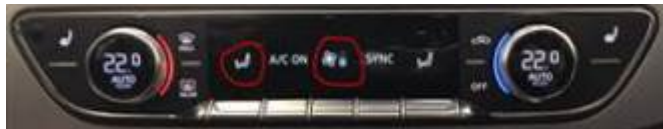
Figure 7. 72° f (22° c), Sync, air distribution to footwell, medium blower speed.