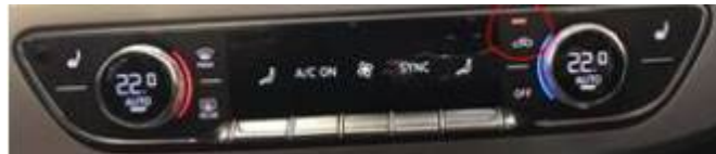
Figure 5. Auto, 72° f (22° c), Sync, air recirculation mode.