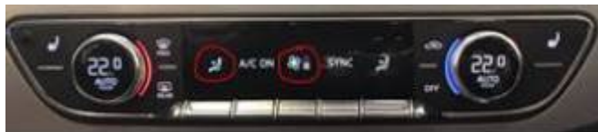
Figure 8. 72° f (22° c), Sync, air distribution to central vent, medium blower speed.