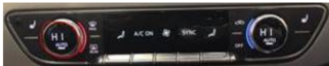
Figure 4. Auto, HI, Sync.