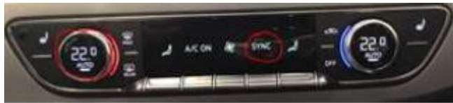
Figure 2. Auto, 72° f (22° c), Sync.