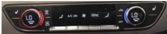
Figure 3. Auto, LO, Sync.