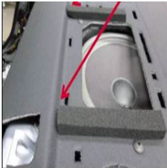
Figure 1. Foam strip installation for vehicles with Audi sound (PR code 9VD) .

The 150mm damping strips must reach up to the edge, see arrows.