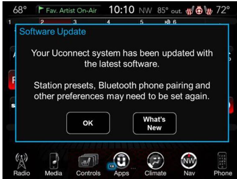
Fig. 4 Confirmation Screen