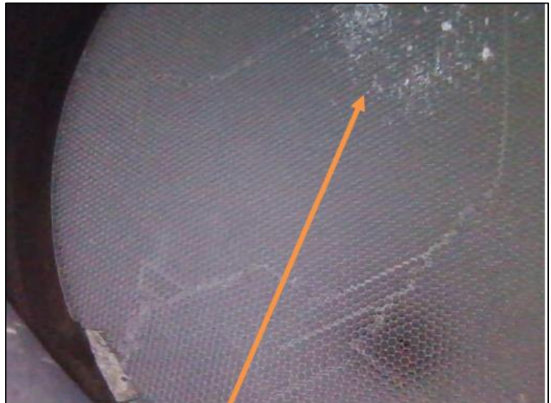
Damage to bank 2 catalytic converter.