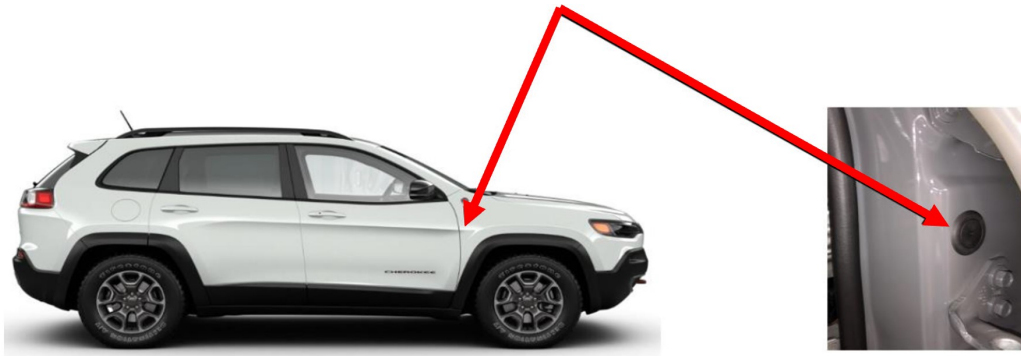
Fig. 1 A-Pillar Sealing Plug Location