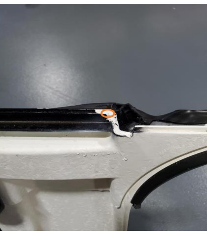
Fig 3 and 4 Add butyl to corner under the seal. Butyl location under the seal

This document does not authorize warranty repairs. This communication documents a record of past experiences. STAR Online does not provide any conclusions about what is wrong with the vehicle. Rather, it captures all previous cases known that appear to be similar or related to the vehicle symptom / condition. You are the expert, and you are responsible for deciding on the appropriate course of action.