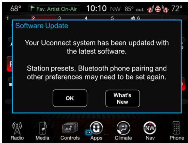
Fig. 4 Confirmation Screen