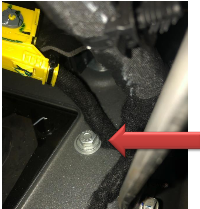
Wiring Harness Crushed Under Bolt

This document does not authorize warranty repairs. This communication documents a record of past experiences. STAR Online does not provide any conclusions about what is wrong with the vehicle. Rather, it captures all previous cases known that appear to be similar or related to the vehicle symptom / condition. You are the expert, and you are responsible for deciding on the appropriate course of action.