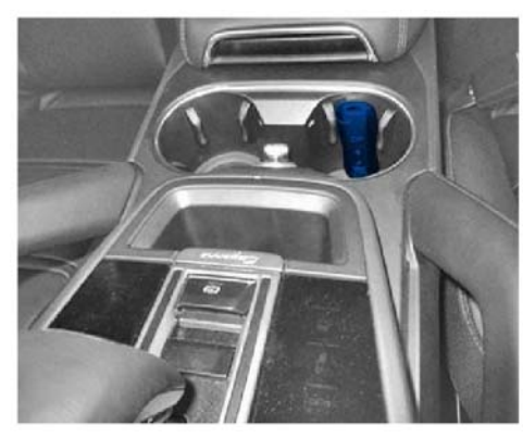
Emergency start tray