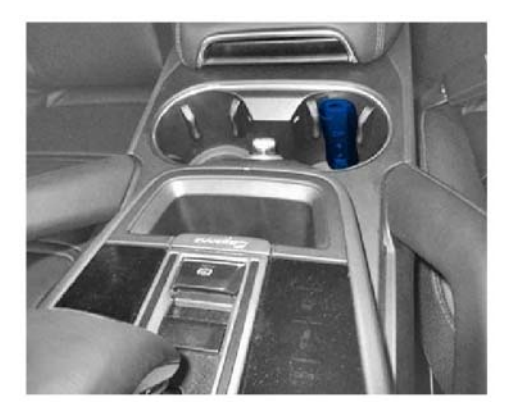
Emergency start tray

The vehicle type is then read out, the diagnostic application is started and the control unit selection screen is populated.