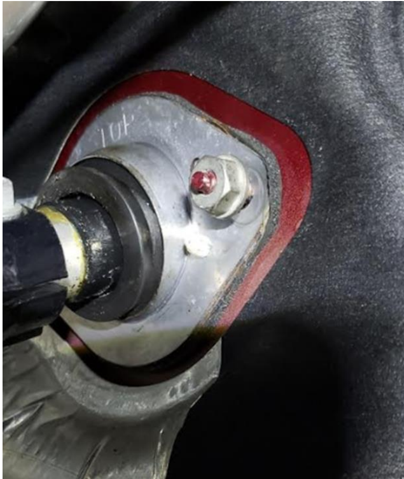
Fig 2. Late design "TOP".

This document does not authorize warranty repairs. This communication documents a record of past experiences. STAR Online does not provide any conclusions about what is wrong with the vehicle. Rather, it captures all previous cases known that appear to be similar or related to the vehicle symptom / condition. You are the expert, and you are responsible for deciding on the appropriate course of action.