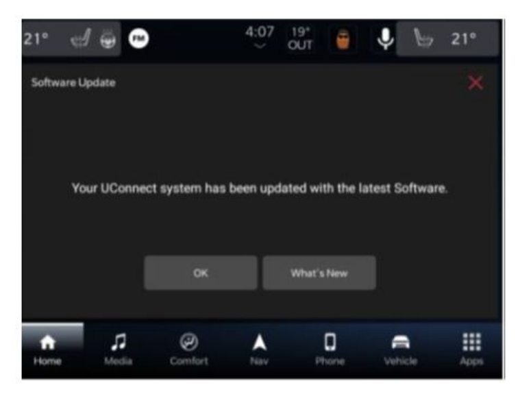
Fig. 2 Software Update Confirmation Screen

3. Upon completion of update, the radio will display a confirmation message (Fig. 2) .